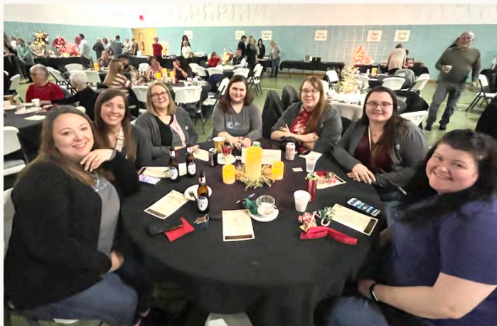
Your Legacy Federal Credit Union corporate sponsor table at Deck the Halls Holiday Celebration, a fundraiser for St. Francis Senior Ministries.